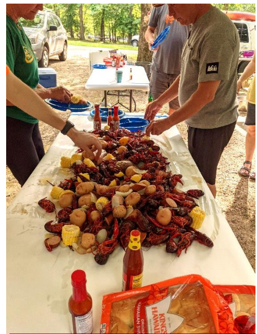
Cavers line up at the table for the crawfish boil.

At the meeting, once we went through the traditional formalities and reports, we had a brief discussion on the possibility of changing the format of MSS meetings. Discussion centered around dropping