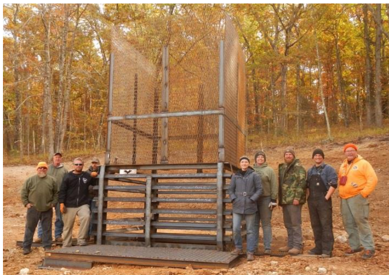
Garatee Mine Vertical Chute Closure

Mine shaft on the Valles Mines property, which is privately owned. This was a CRF project in support of the Missouri Department of Natural Resources' Land Reclamation Division. The primary objective was to ameliorate a serious public hazard (a deep, open vertical mine shaft), while preserving the habitat and viability of a sizable gray bat maternity colony. Five tons of steel went to close the shaft. The vertical chute measures eight feet by eight feet square. Two removable gate bars and a pre-engineered rigging point will allow bat biologists to visit the gray bat colony, and for cave surveyors under the leadership of Jim Sherrell and Adam Marty to continue to map this large, mined,