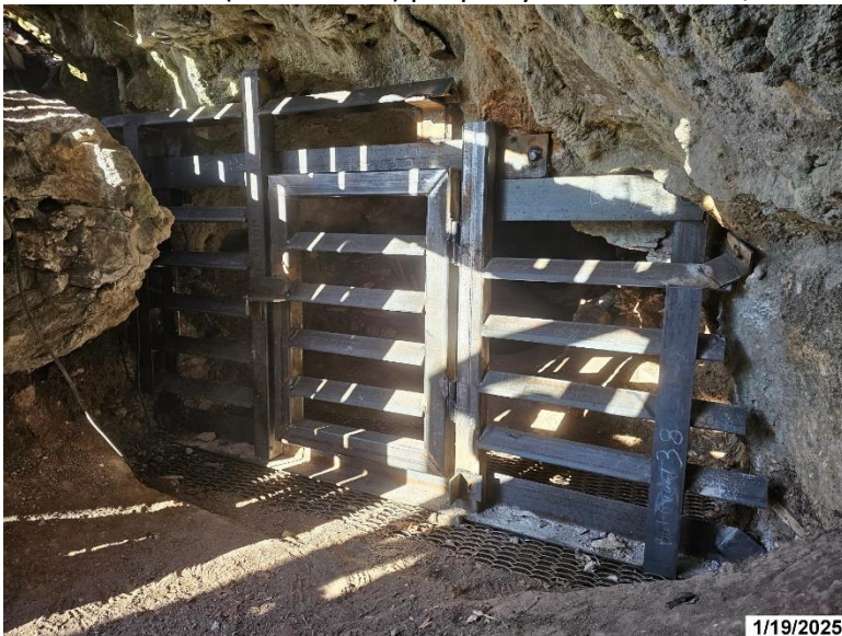
New Neongwah Bear Cave Gate